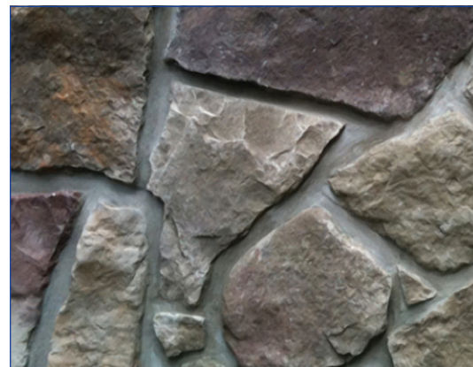
Manufactured Stone Veneer